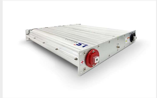
* This is an image for reference.

It can be applied in wind power, hybrid systems, industrial automation, power backup and stabilization. Imagination is its only boundary.